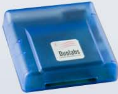
Interface CAS2 / CAS3

To programm your Diablo Cam you will need the following components: